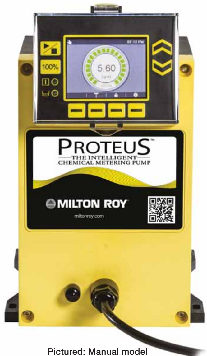
Pictured: Manual model

Selecting the right pump just got easier. No complicated configurations are necessary to find the right pump. With the Manual, Enhanced, and Communications models offered, simply pick the features that fit your needs (see page 6 for a complete list). Our models offer a wide range of functionality including backlit display, multilanguage, and 2-way communication to name only a few.