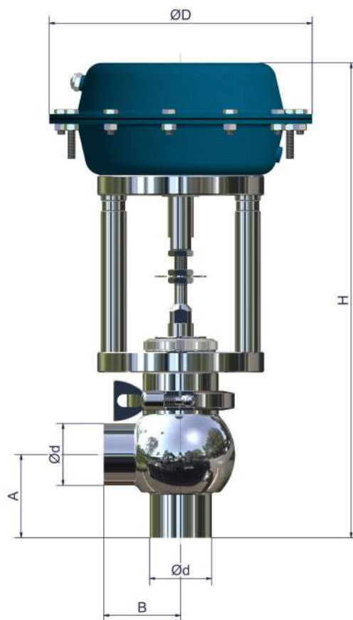
Dimensions (mm) - (valve body with BW connections)